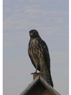
Hawk on Lot 79 Sign Post

Please visit our new web site and e-mail the Committee of interest. Your help is greatly appreciated.