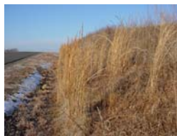
Neglected grassy bank

For the coming season we have renewed our