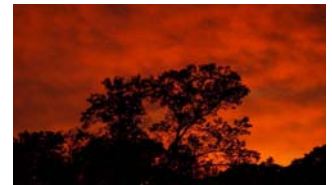
Sunset on Sunrise Bay—From Lot 80 Front Yard.

If you owe dues for prior year (s), please pay asap before the POA is forced to seek legal remedy.