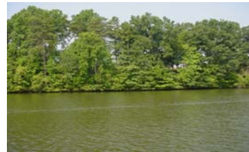
Lake Anna in the Summer...C'mon...

Common areas in Sunrise Bay are not intended to be a storage lot for boats, trailers, etc. Nothing should be left in the Common areas overnight. If you are storing trailers on Common Area "A", please remove them asap.