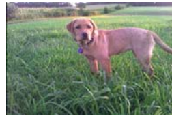
British Red Fox Lab in the field

A second project in Common Area "A" mentioned in the last newsletter was the paving of the down hill approach and the turnaround area to the boat ramp. This area was deteriorating due to heavy traffic and an insufficient drainage system. This project was completed in time for the boating season.