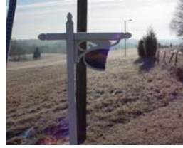
Broken Sunrise Bay Sign